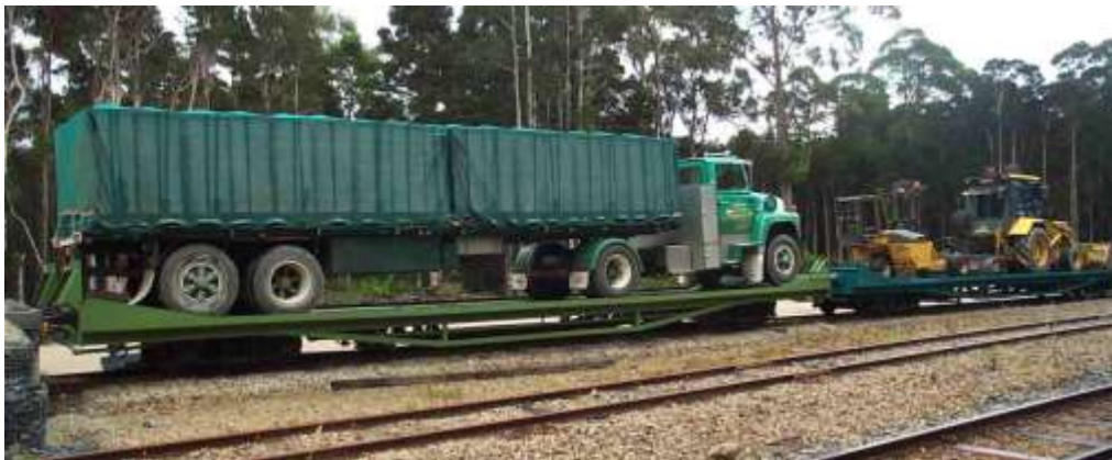
Figure 16 1 million passengers (bees) on their way to Teepookana Plateau